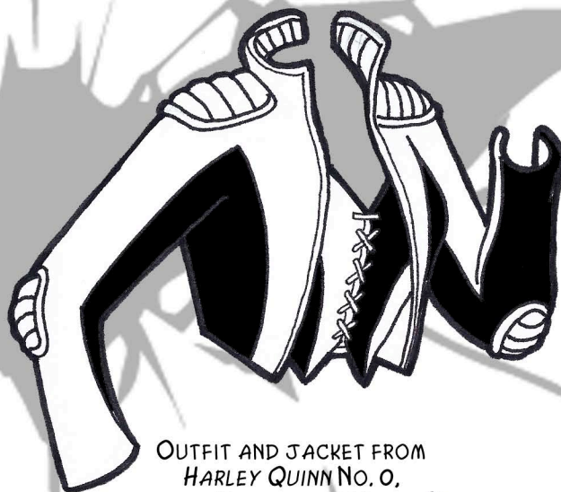
OUTFIT AND JACKET FROM HARLEY QUINN No. 0, JANUARY 2014