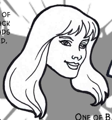
ONE OF BARBARA'S OUTFITS FROM BATMAN FAMILY NO. 3, FEBRUARY, 1976